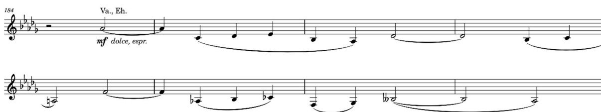
Example 10. Love Theme: Romeo and Juliet (1880), mm. 184–191

In the 1870 version, the exposition and most of the recapitulation are preserved, solidifying the feud and love themes as the centerpiece of the overture. Additionally, ten measures in the development are preserved (mm. 274–283 in 1869 numbering, mm. 325–334 in 1880 numbering), mainly serving as a transition towards the climax of the development. The rest of the material is rewritten. The original friar theme, perhaps too jovial and majestic in nature, is scrapped and replaced by a darker woodwind theme. The structure of the development is completely reworked, with the climax being changed from a conflict between the three themes (mm. 286–309 in 1869 numbering) to only a conflict between the friar and feud themes (mm. 335–352 in 1880 numbering). Finally, the coda is restructured to focus on the love theme, beginning with a dreamy allusion to it in B major before revealing a dark reworking—effectively providing the death of the love theme. The 1880 revision switches the order of these two statements, letting the brighter and more hopeful statement ring at the end.