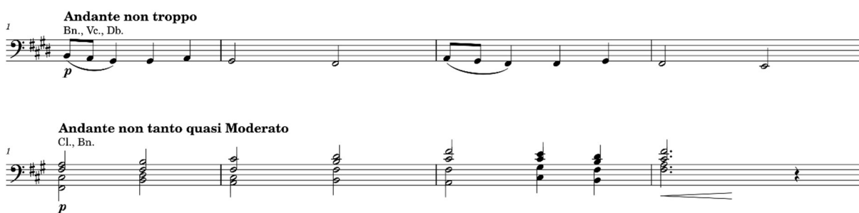
Example 8. Original Friar Theme: Romeo and Juliet (1869), mm. 1–4; New Friar Theme: Romeo and Juliet (1880), mm. 1–4