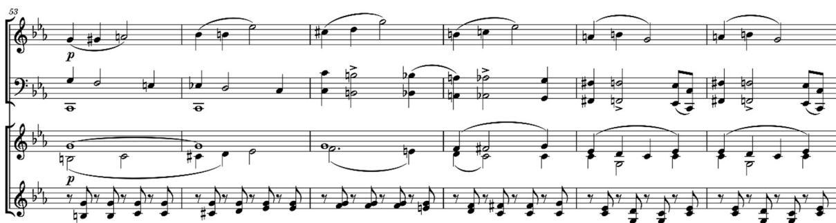
Example 1. Second Symphony (1872), First Movement, mm. 53–58