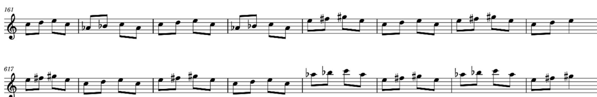
Example 5. Second Symphony, Fourth Movement, mm. 161–168; Second Symphony (1872), Fourth Movement, mm. 617–624

A prominent example of this symmetry is in the minor mode passage of the first theme group, shown in Example 6. The first appearance of E as a tonic in the movement is at m. 105, when the Crane theme is stated in E minor (the iii of the primary key). The corresponding moment in the recapitulation occurs at m. 561 in the original version and is in G \sharp minor, which is enharmonically equivalent to A \flat (Example 7). As a result, the M3/d4 relationship between the three notes avoids introducing new harmonies in this passage.