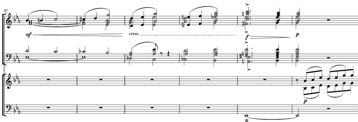
Example 2. Second Symphony (1879), First Movement, mm. 87–92